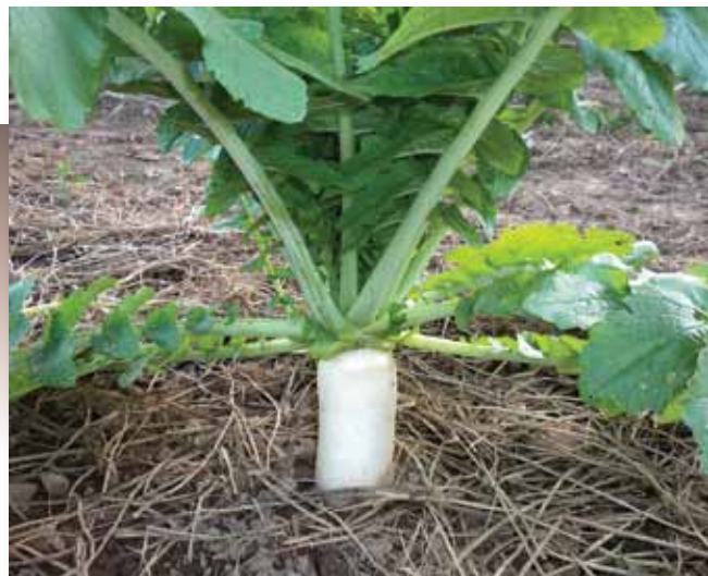
► Left: Oilseed radish taproot compared with 1-ft ruler. Right: “Tillage radishes” can be used as a biological tool to reduce the effects of soil compaction.

Oilseed radish seed is generally more expensive than seed of other cover crops commonly grown in Michigan.