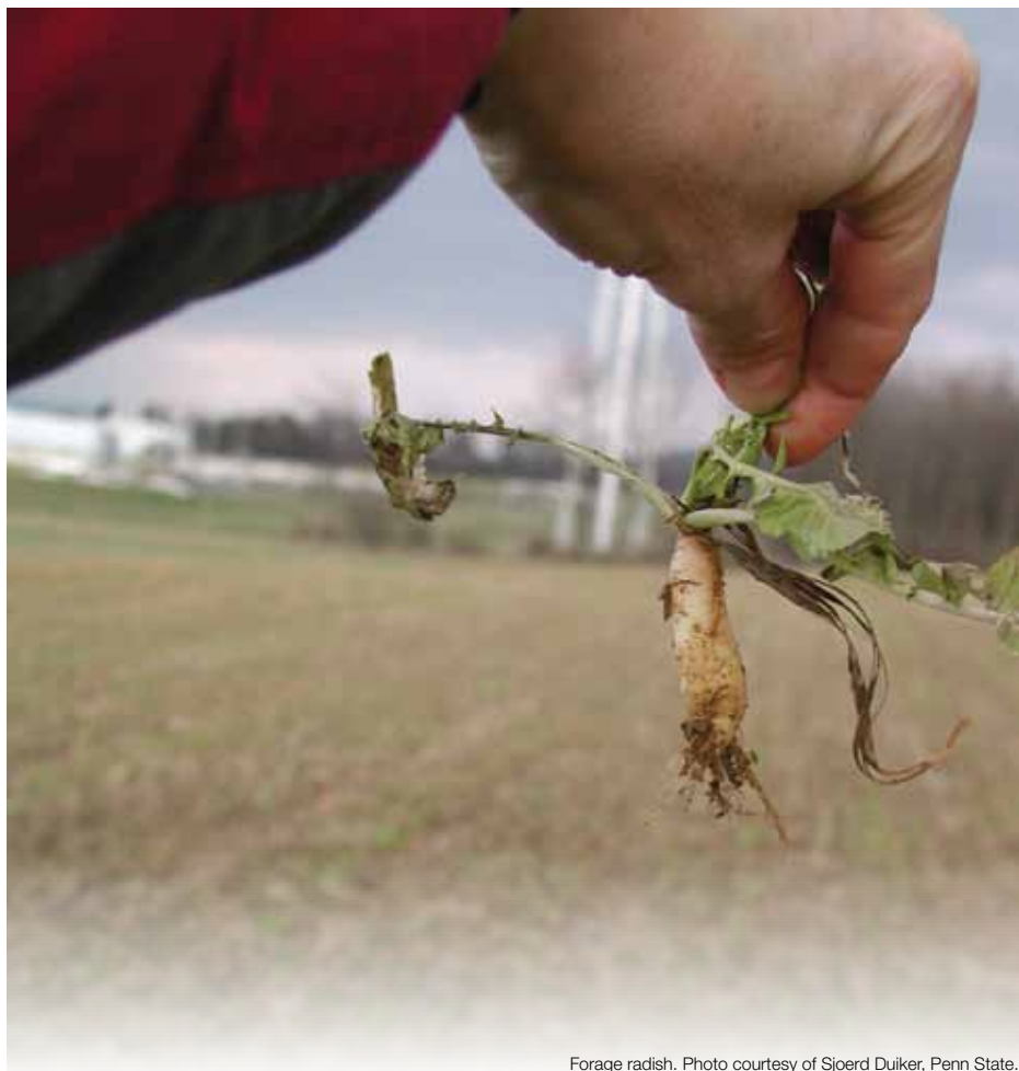
Forage radish.

If you want to reduce soil compaction, good cover crop choices are radish, canola, turnip (and hybrids), sugarbeet, sunflower, and sorghum-